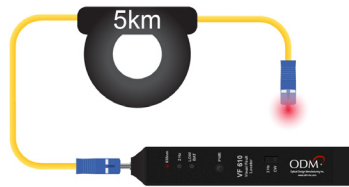
Laser is visible at fiber endfaces or patch panels up to 5km away from VF 610 output port.